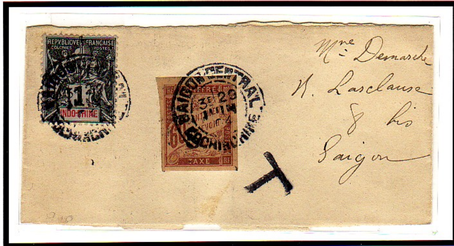
POSTAL MARKINGS SAIGON-CENTRAL COCHINCHINE 29 JUN 04 large plain "T"

One-centime stamps were insufficient postage for these wrappers mailed internally within Saigon in 1904.