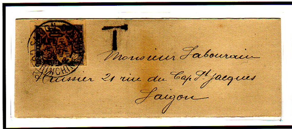
POSTAL MARKINGS SAIGON-CENTRAL COCHINCHINE 28 AOUT 05 large, plain "T" (postage due)

In 1905, the sender failed to add any postage to a wrapper addressed locally within Saigon. As a consequence, a postal clerk applied a large "T" with black ink. Additionally, he affixed a 5-centime postage due stamp for the minimum postage due amount.