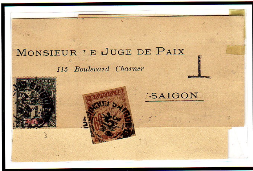
POSTAL MARKINGS SAIGON-CENTRAL COCHINCHINE 25 JUN 04 large plain "T" SAIGON-CENTRAL COCHINCHINE 26 JUN 04