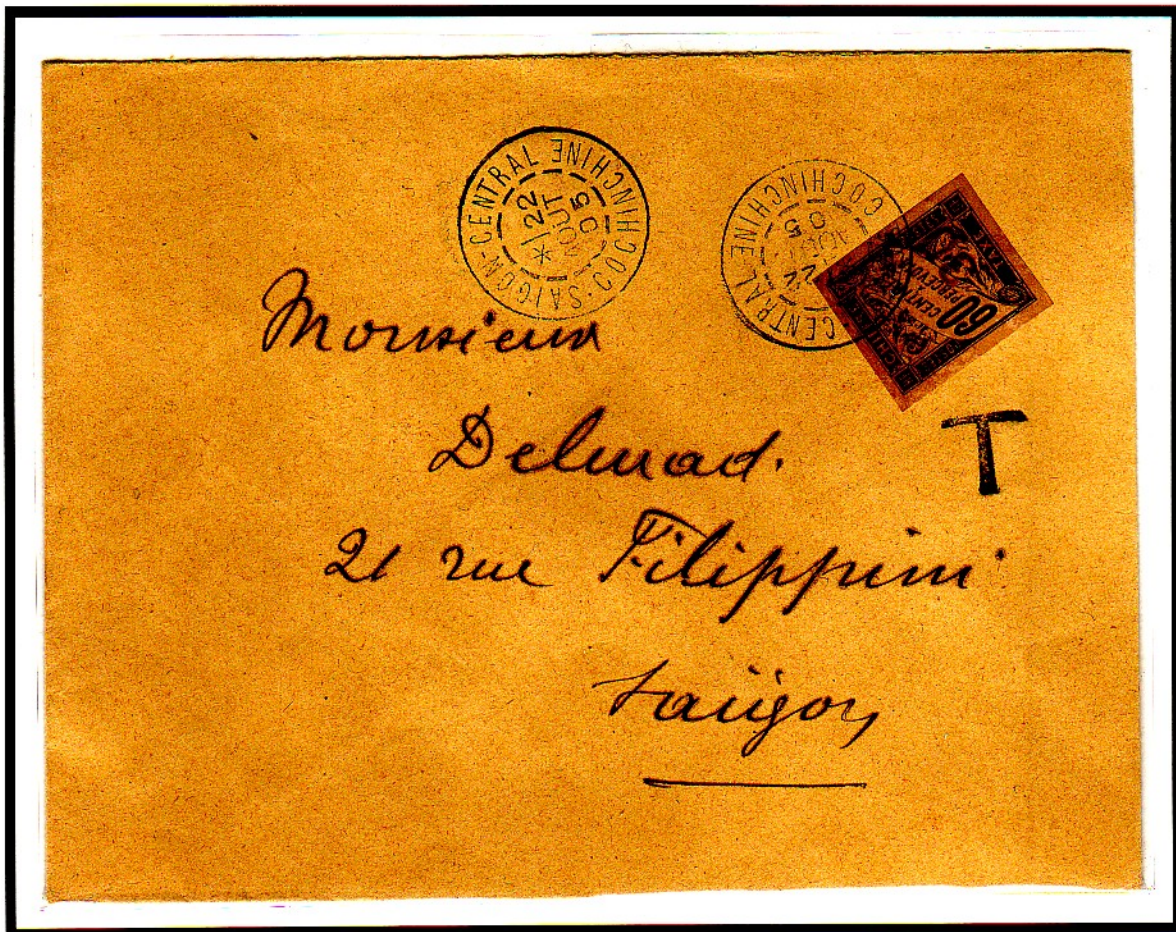
POSTAL MARKINGS SAIGON-CENTRAL COCHINCHINE 22 AOUT 05 large, plain "T" (postage due)

Since the sender had failed to attach postage in the amount of 15 centimes needed for an internal letter, the Saigon post office charged the letter postage due in the amount of 30 centimes, twice the short payment. Besides the large "T" signifying "postage due," the envelope bears an example of the 30-centimes provisional postage due stamp.